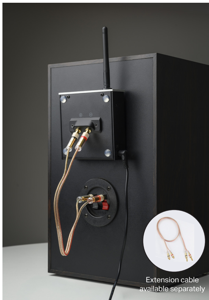
Extension cable available separately