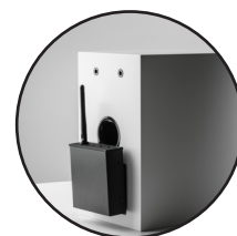
Directly attached to the speaker terminals