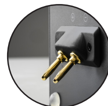
Gold plated banana connectors