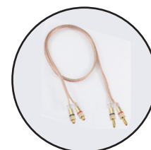
Extension cable available separately