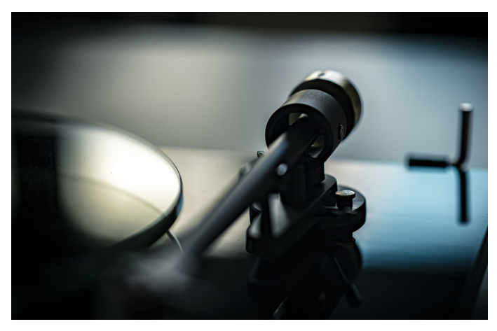
Speed Control, Motor and Drive

The elegantly crafted CNC-machined plinth has been expanded in size to enhance stability and is available in striking finishes such as High Gloss Black , Satin White , or Walnut. It boasts a construction free of plastic components and meticulous manufacturing that eliminates any hollow spaces within, effectively preventing unwanted vibrations within the chassis. Furthermore, the glass platter in the T2 has been made heavier and thicker compared to its predecessor, ensuring a zero-resonance design that effectively eliminates the shortcomings associated with plastic or lightweight steel alternatives. Complementing these improvements, purpose-selected turntable feet effectively isolate the T2 from ambient vibrations present in the vicinity of your hi-fi system.