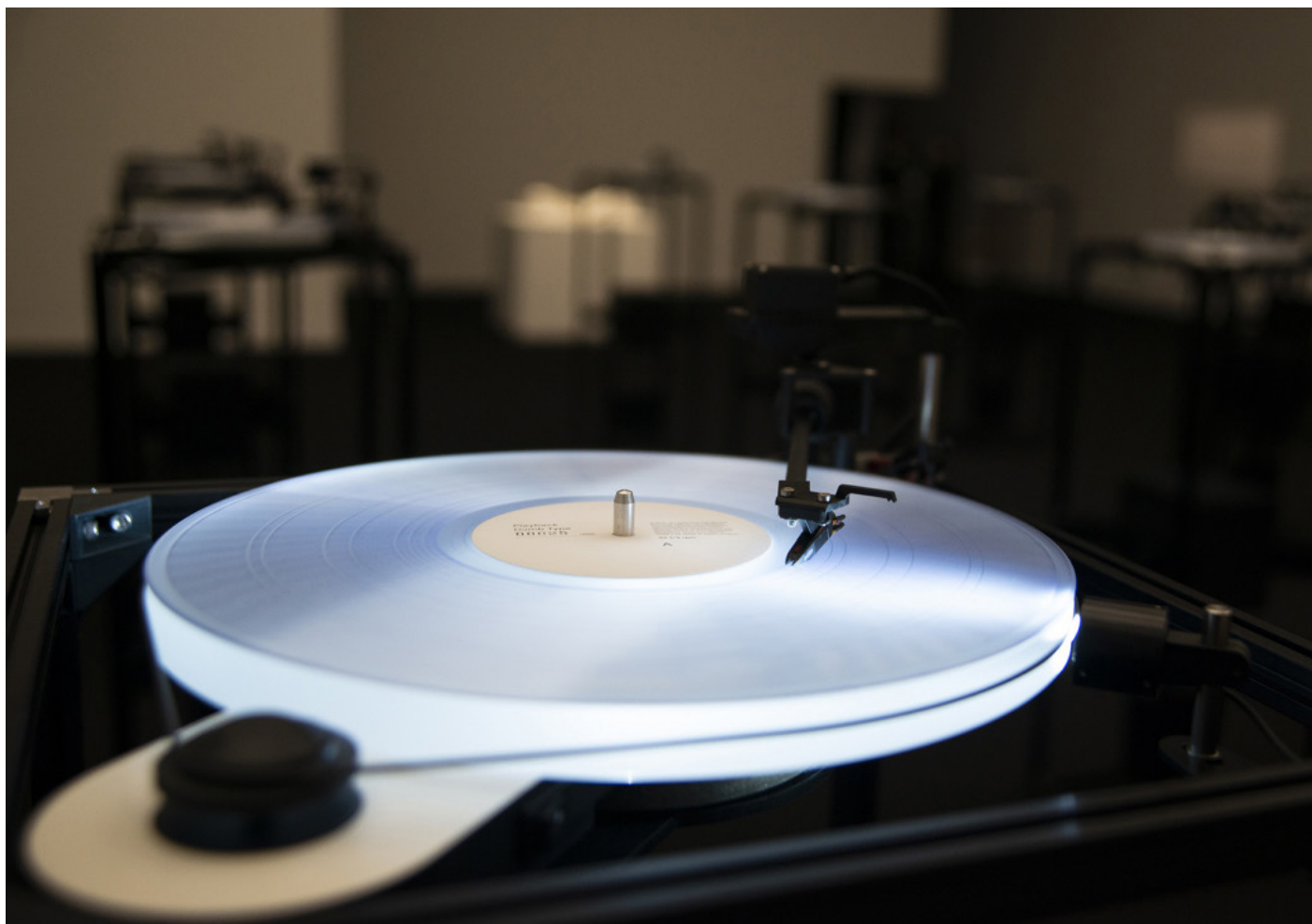
Dumb Type installation, Playback , at Museum of Contemporary Art Tokyo

realization of the group's projects. Their works has been presented in numerous festivals and exhibitions, including the Venice Biennale (2003), Seoul International Modern Dance Festival (2005), Melbourne International Arts Festival (2006), The Athens Concert Hall (2009), solo exhibition at Centre Pompidou-Metz, France (2018) and Museum of Contemporary Art Tokyo (2019), among others.