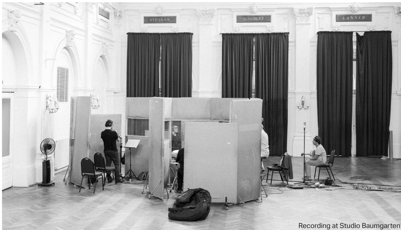
Recording at Studio Baumgarten

ta mixing desk without any editing. This requires artists who are absolute virtuosos at their respective instruments and are comfortable in this type of recording situation.