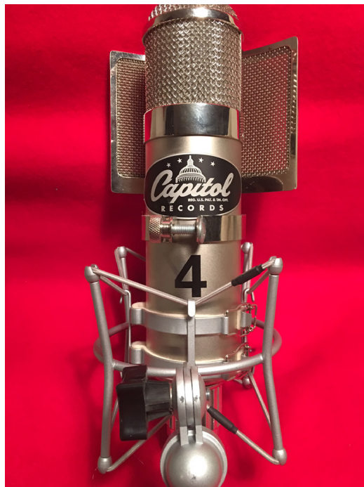
Neumann U47 with modded capsule

The performance was directly recorded to an Otari 8-track tape machine via an old refurbished Acous-