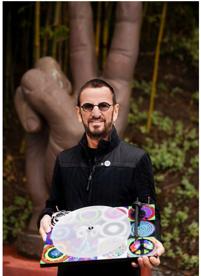
Ringo Starr with the Peace & Love Turntable.