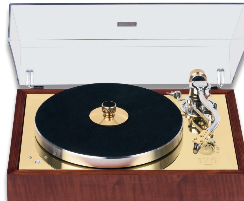
Wood Chassis in Dark Cello

Supplied with the 175 is a hand-selected cartridge, the result of a collabo