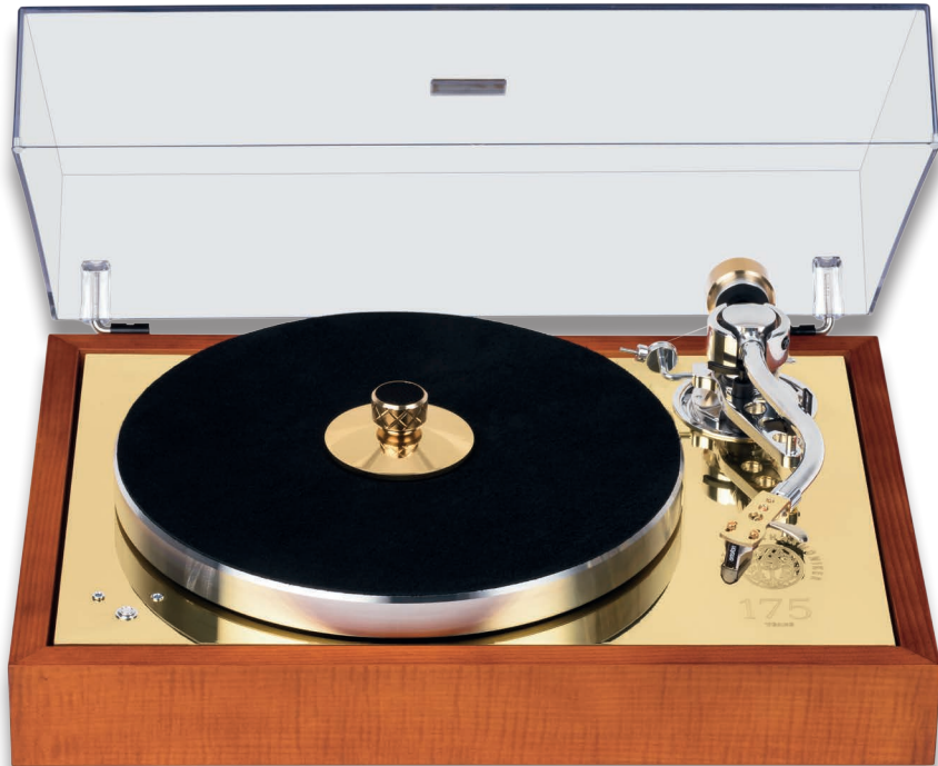
Wood Chassis in Bright Violin

A limited edition series of 175 samples, the 175 offers music aficionados a unique collector's item in a classical design. It is available in two colours: Dark Cello or Bright Violin. At the back of the turntable is a plaque with the serial number and the name of the owner.