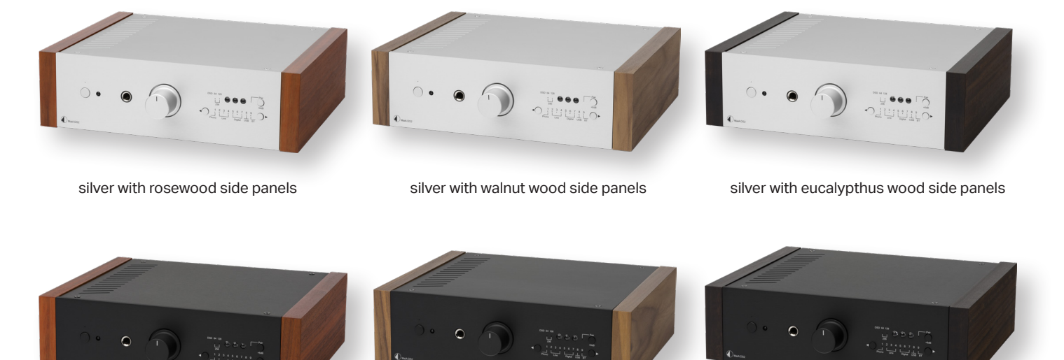
black with rosewood side panels