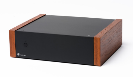
silver with rosewood side panels