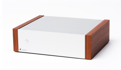
black with rosewood side panels

A four layered PCB enables us to use shorter signal paths, which are also responsible for the improved sound compared to its predecessor. Amp Box DS2 will fill your home As a sonic guideline for Pro-Ject amplifiers the with the lush, energetic and smooth sound, usually found homogeneous liquid sound of audiophile tube in much more expensive products. As additional upgrade amplifiers are used as benchmark. All our next you can use our Power Box DS2 Amp to improve the soundgeneration devices offer the possibility to come quality even further. The casing, made of aluminum and with wooden side panels. The side panels give the metal, is both elegant and solid, to protect against vibration products a very classy and unique look. Three and deliver highest aesthetics. The unmatched sound and different finishes (rosenut, walnut and eucalyptus) are the no compromise components make it an audiophile high end bargain!