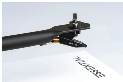
One piece 8.6" aluminum tonearm Cartridge: Ortofon OM10

standard version, such as the diamond-cut aluminum drive pulley, the resonance-optimized MDF main platter and MDF chassis. The refined, high-precision platter bearing has significantly lower tolerances than Essential II. Equipped with the high-quality pickup OM10 by the phonographic cartridge pioneer Ortofon, Essential III Phono delivers lively, balanced and highly involving sound that will delight every vinyl lover.