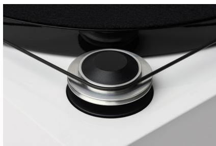
Diamond-cut aluminum drive pulley: precise power transmission