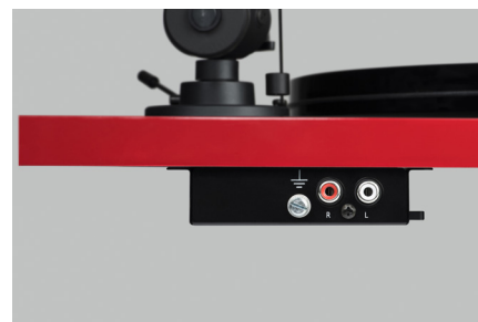
Switchable line or phono output