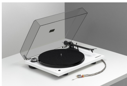
Dust cover, felt mat and high quality connection cable Connect-it E included